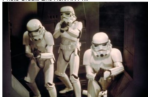
Star Wars: A New Hope in Concert