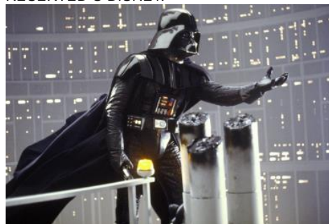
Star Wars: The Empire Strikes Back in Concert